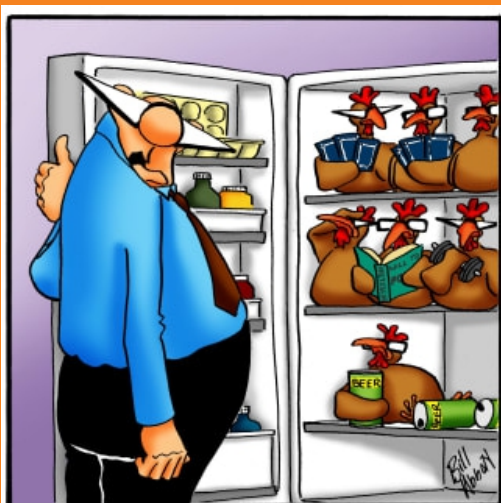
"Yes, I'm positive the eggs have gone beyond their expiration date."