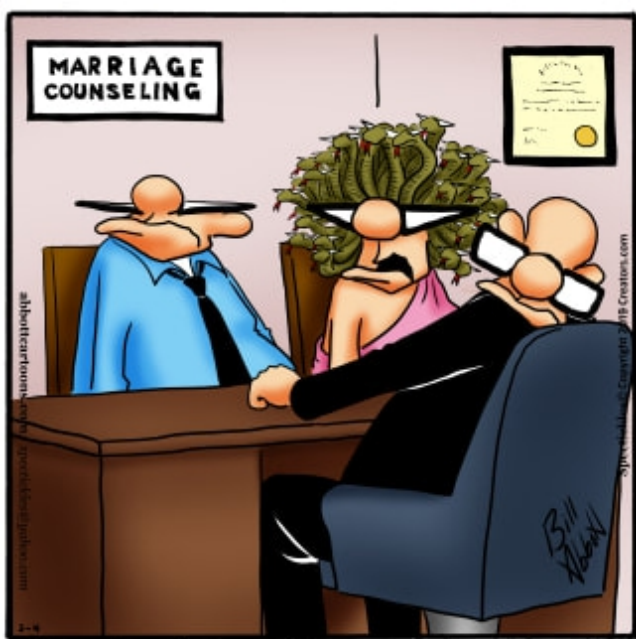
"What does it mean for our relationship when he refuses to make eye contact?"